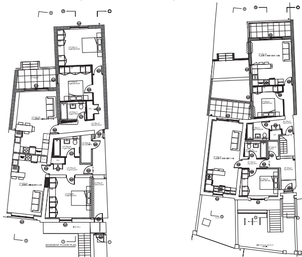
LOWER AND GROUND FLOOR