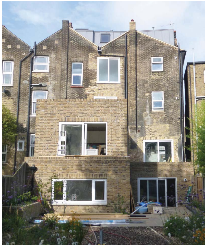
REAR OF PROPERTY DURING CONSTRUCTION PHASE