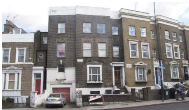
STREET ELEVATION PRIOR TO DEVELOPMENT

With a mix of 1 and 2 bedrooms, all seven new units provide a large living/kitchen area and are finished to a high standard with modern fittings.