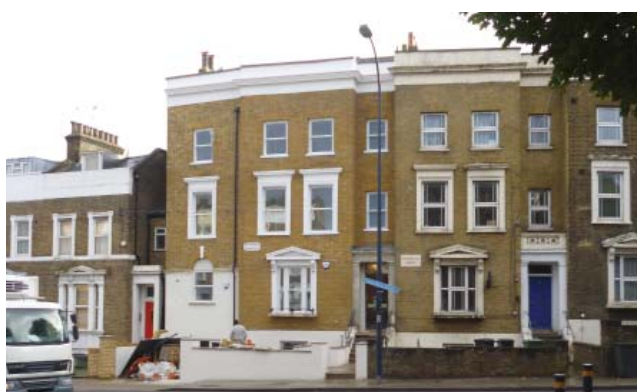
STREET ELEVATION AFTER DEVELOPMENT